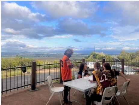
Youth Workshop 2022