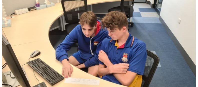
Get Ready Program