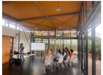
Youth Workshop 2022