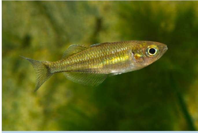
Female Malanda Rainbowfish from Williams Creek East Branch (35 mm TL).

The fish is named due to its restricted distribution in the headwater streams of the North Johnstone River in the Malanda district, on the southern Atherton Tablelands in Queensland. The Queensland Place Names Database gives the following origin for the name of the town of Malanda: "Derived from Malanda Creek, which reportedly is an Aboriginal name, lan-