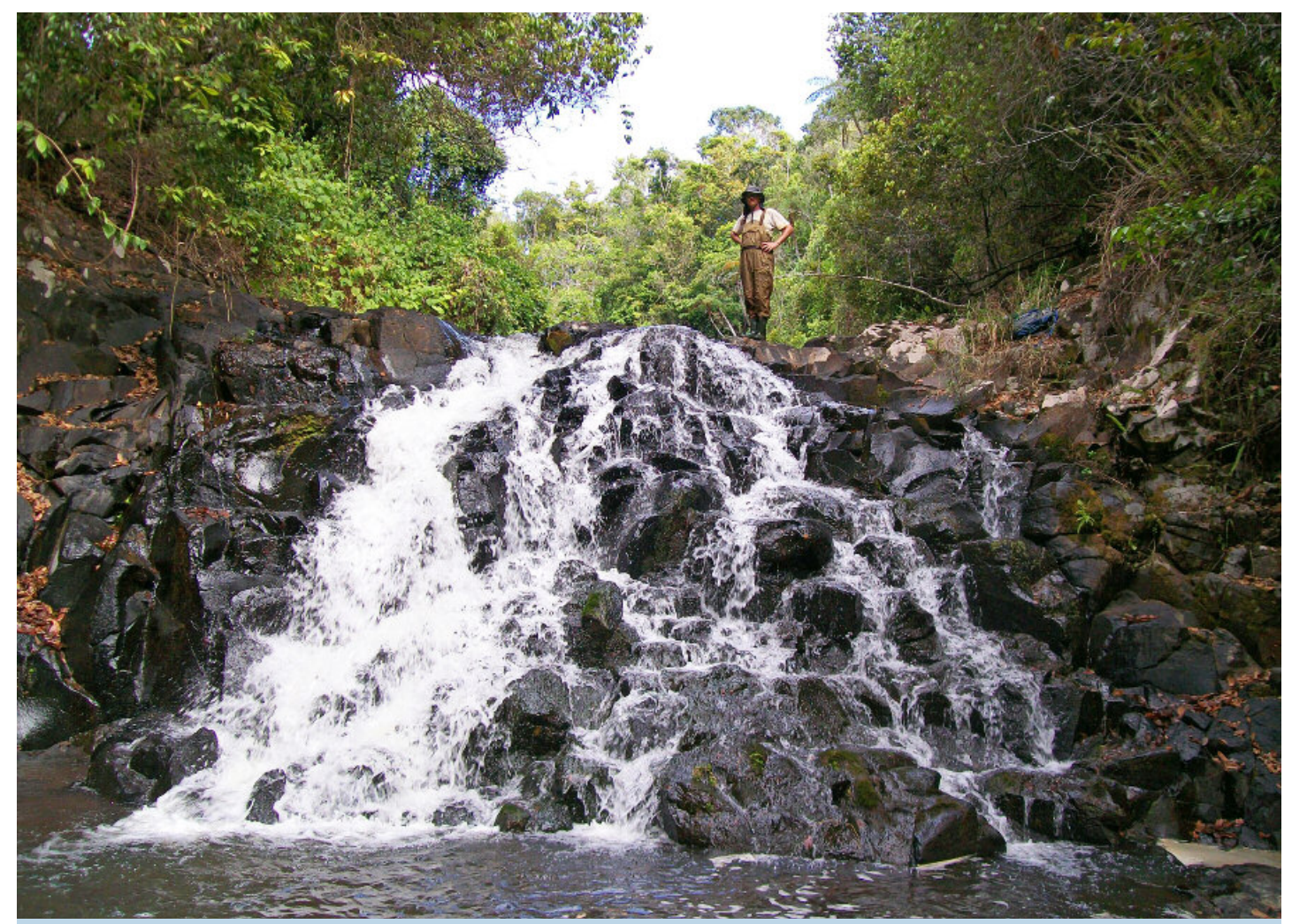
One of two waterfalls approximately 100 m apart on the Ithaca River that prevents rainbowfish occuring further upstream. Malanda Rainbowfish have now been translocated to the upper reaches of the river.

Rainbowfish. In 2016 the fish throughout Thiaki Creek were clearly quite mixed with Eastern Rainbowfish. Thus today virtually all of the Ithaca/Thiaki system contains Eastern Rainbowfish and/or hybrids with Malanda Rainbowfish, except for the upper most section of the unnamed tributary to Molo Creek and two small dams adjacent to lower Thiaki Creek on a small side tributary. Rainbowfish from upper Molo Creek proper have some genetic evidence of introgression (mixing) with Eastern Rainbowfish. In lower Molo Creek there is a concrete causeway about 900 m above the junction with Thiaki Creek. This causeway has a pipe with a small drop of perhaps 20 cm. Below the