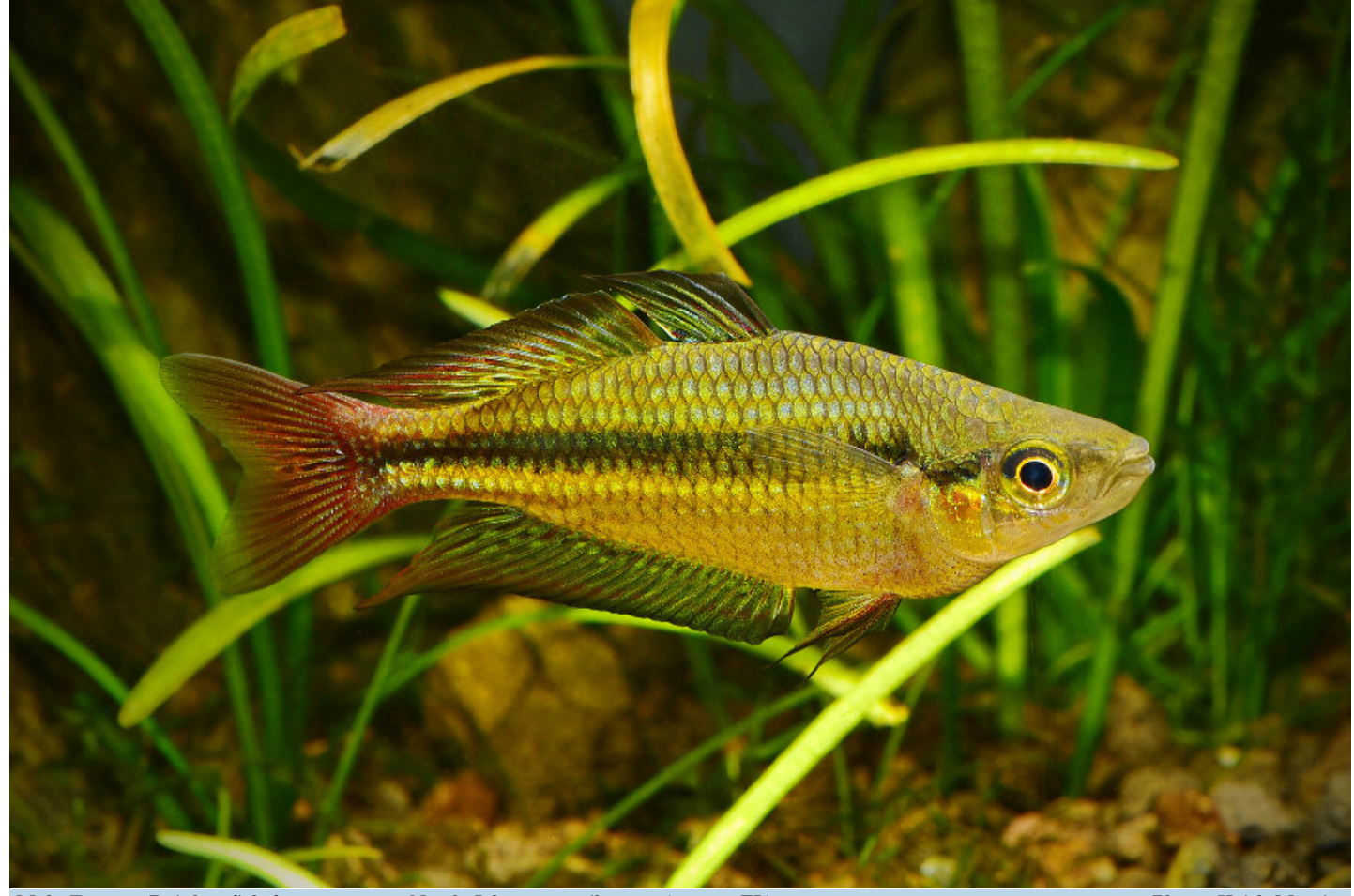
Male Eastern Rainbowfish from an upper North Johnstone tributary (75 mm TL).