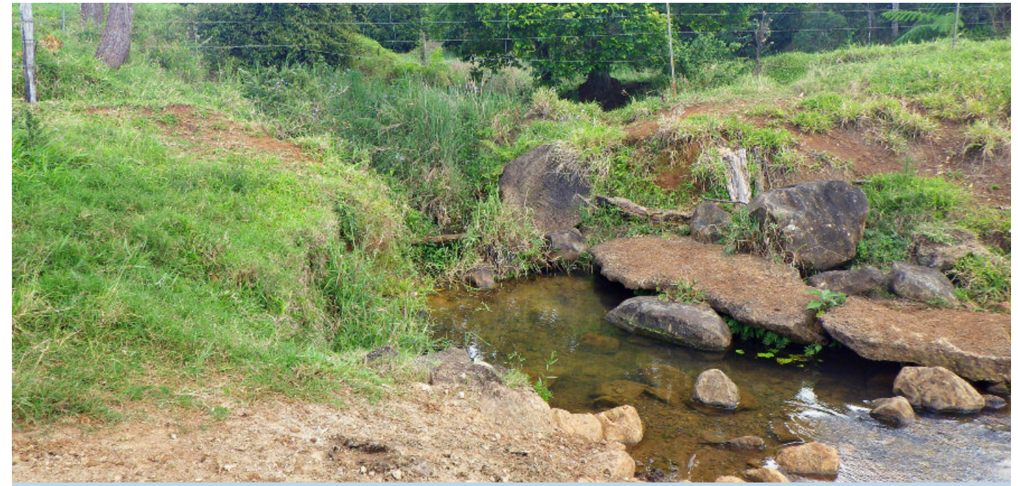
A minor barrier formed by a small dam on Williams Creek West Branch that represents the upstream limit of hybrid rainbowfish as of August 2016. Pure Malanda Rainbowfish were found upstream of this point.

based on pictures posted on the ANGFA forum, whereas by 2016 they were very clearly dominated by Eastern Rainbowfish. Two causeways around 950 m apart are present in the mid section of Williams Creek east branch. Both have drops of perhaps 15-20 cm, but would be easily passable during slightly higher flows. Rainbowfish below the lower causeway were clearly dominated by Eastern Rainbowfish hybrids, fish above the causeway looked like Malanda Rainbowfish (but are probably slightly mixed based on what we found upstream). At the upper causeway some rainbowfish below it appeared to have some introgression, but most were quite Malanda Rainbowfish like. Above the causeway we only observed Malanda Rainbowfish. We suspect though that fish both below and above this upper causeway probably have some introgression given the