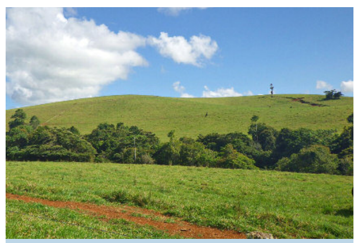
Typical modern-day landscape on the Atherton Tablelands – cattle country in the Williams Creek catchment.