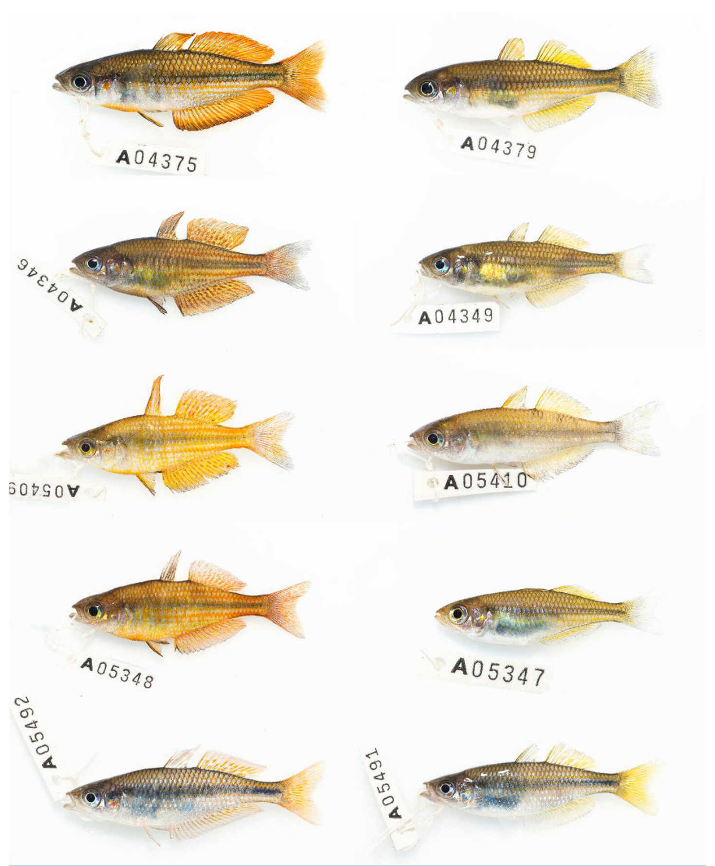
Pinned rainbowfish samples from upper North Johnstone streams; numbers represent museum codes. Males on the left with the corresponding female on the right. Top to bottom: Lake Eacham Rainbowfish from Dirran Creek. Malanda Rainbowfish – first from unnamed creek Wallace Road above falls; then Williams Creek East Branch at Jaggan; then Williams Creek West Branch. Bottom line is Eastern Rainbowfish from Gillies Creek, south of Tarzali.

Rainbowfish is a dwarf species, growing up to 61 mm for males (but usually under 50 mm), and females slightly smaller. The body is laterally compressed, con-