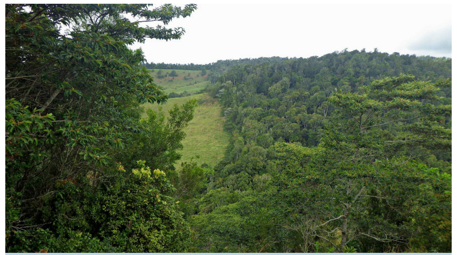
Rainforest bordering cleared agricultural land in the upper Thiaki Creek catchment. This entire region was once dense rainforest.