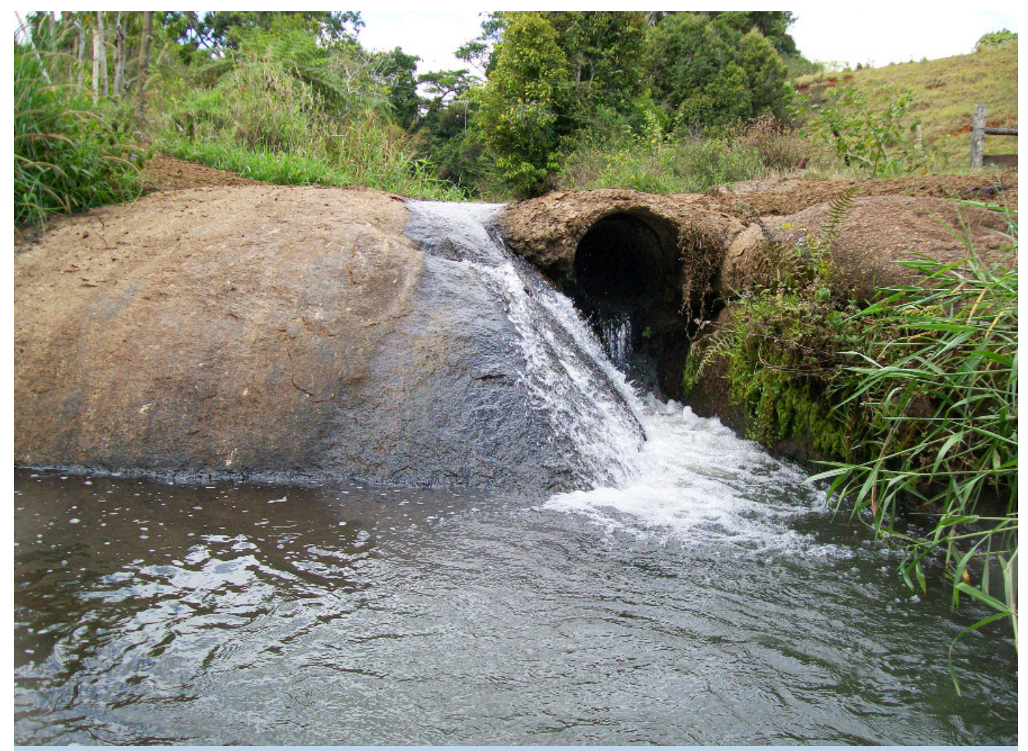
"Barrier" at causeway on lower Molo Creek. Below this barrier most rainbowfish were clearly hybrids, above they looked pure, but with some genetic introgression.