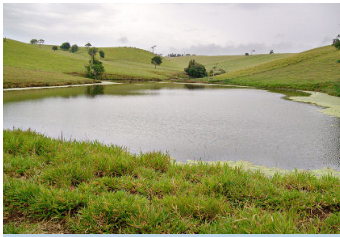
Farm dam by Thiaki Creek, one of the Malanda Rainbowfish release sites.

Given the precarious nature of remaining Thiaki and Williams Creek populations we have started a formally sanctioned and carefully considered program in conjunction with Queensland Fisheries to urgently translocate fish from wild genetically pure populations to refuge habitats (e.g., farm dams) in the upper North Johnstone catchment. As much as possible fish are being translocated within their existing sub-catchments, but we also intend to establish populations else-