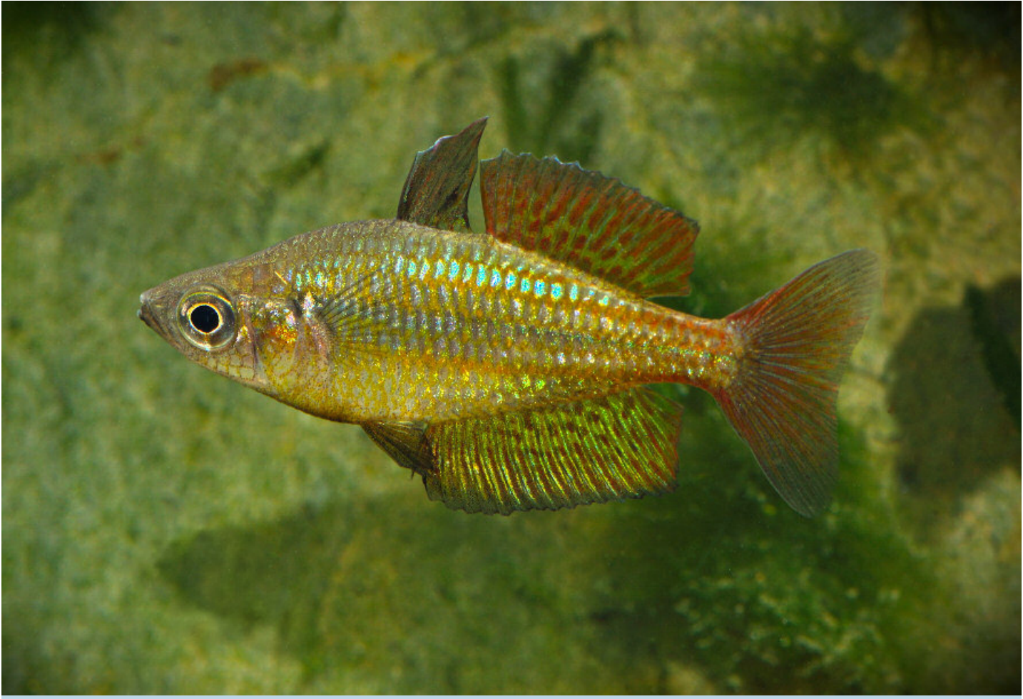
Male Malanda Rainbowfish from Williams Creek East Branch (45 mm TL).