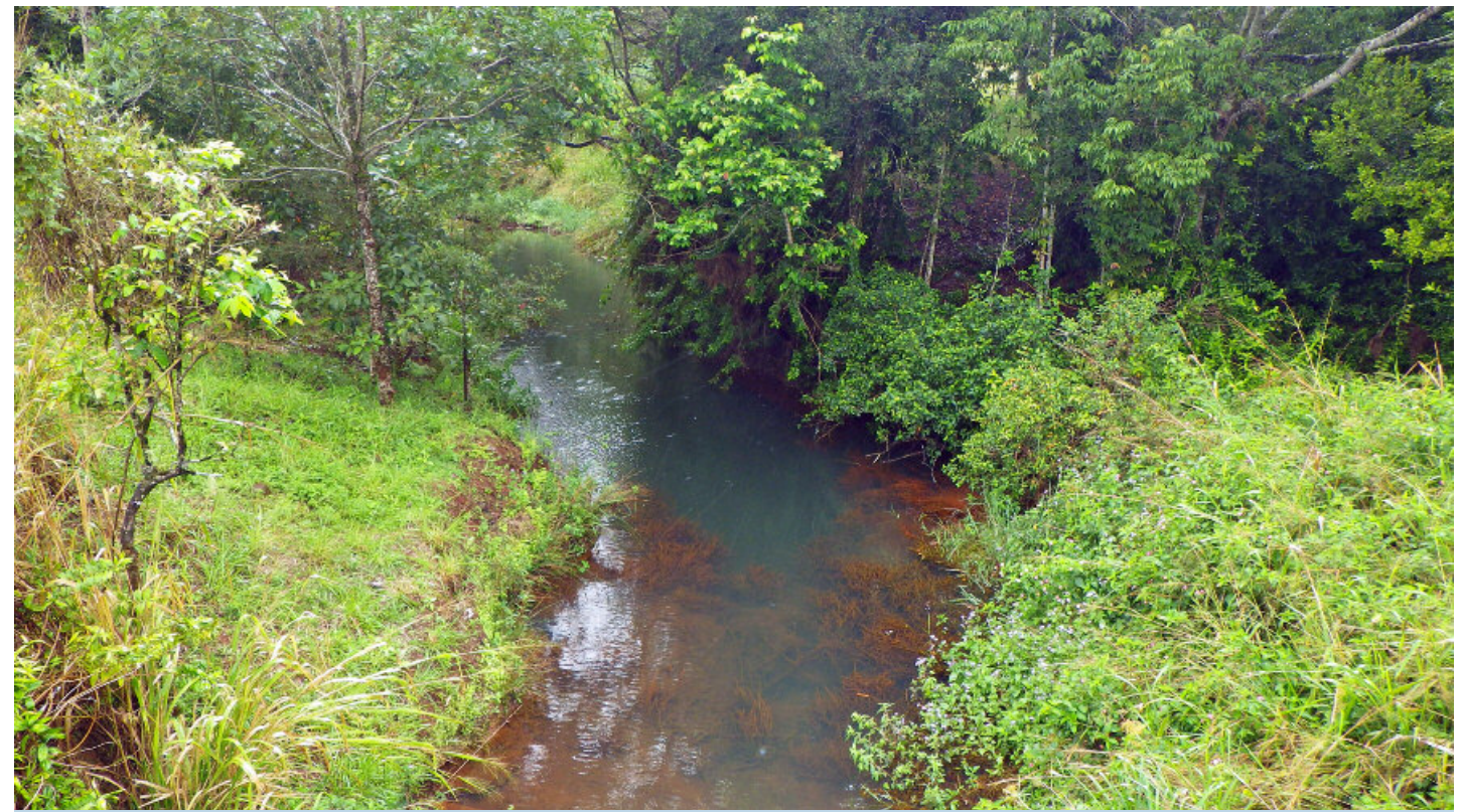
Williams Creek East Branch at Jaggan. This was a source population for many of the Malanda Rainbowfish translocations.