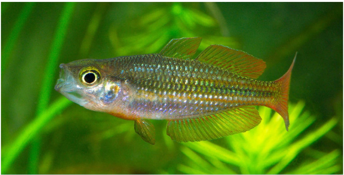
Male Lake Eacham Rainbowfish (yawning) from Dirran Creek, an upper North Johnstone tributary (50 mm TL).

Malanda Rainbowfish was likely common in many smaller rocky creeks in the area prior to European settlement.