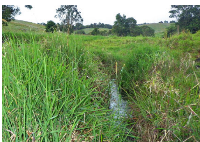
Unnamed creek Wallace Road, above upper waterfall. This section of creek is surrounded by dense Para Grass.

This unnamed creek is a small tributary on the eastern side of the North Johnstone River. This is the only creek system we found that has major barriers which exclude Eastern Rainbowfish. Three waterfalls are present, all are approximately 5–10 m high. In addition, a very large dam is present between the middle and uppermost waterfalls. Eastern Rainbowfish are present below the lowermost waterfall. For some reason no rainbowfish are present between the lower waterfall and the large dam, although Malanda