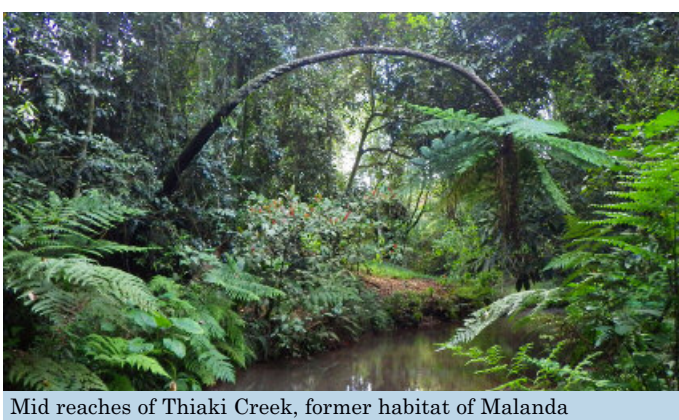
Rainbowfish.