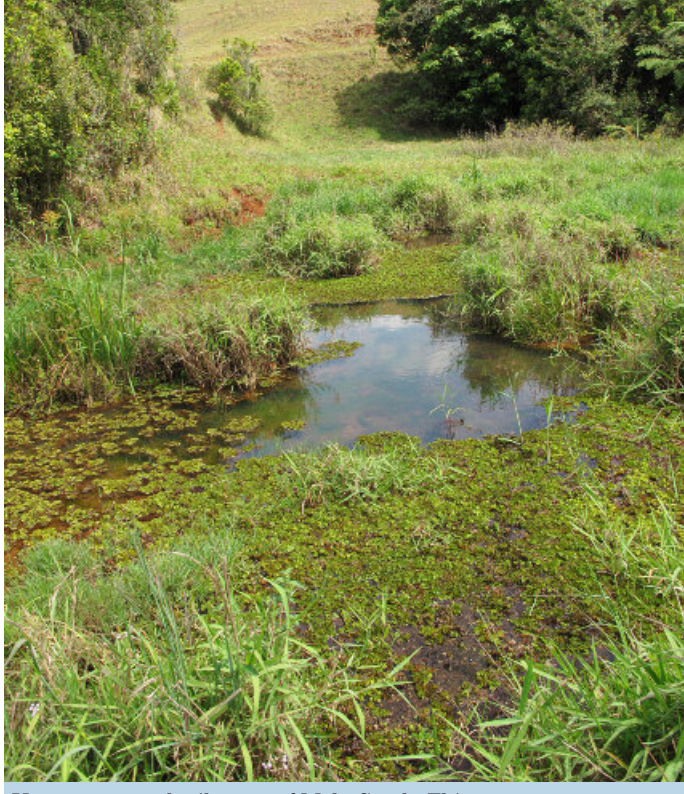
Upper unnamed tributary of Molo Creek. This was a source population for many of the Malanda Rainbowfish translocations.