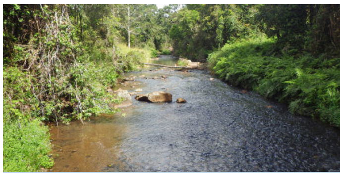
Ithaca River at Clarks Track, east of Jaggan, former Malanda Rainbowfish habitat.

The headwaters of the Ithaca River drains the western edge of the upper North Johnston catchment immediately north of Dirran Creek. This extensive system consists of several major tributaries that include a large unnamed tributary, then Thiaki Creek, its tributary, Molo Creek, and an unnamed tributary to Molo Creek. Ithaca River joins the North Johnstone River approximately 20 km downstream from Malanda. Our sampling has demonstrated an ongoing major decline in Malanda Rainbowfish. Prior to 2000, Malanda Rainbowfish were present well downstream in Ithaca River. The upper section of Ithaca River has two waterfalls a couple of hundred meters apart which have excluded rainbowfish from colonising the upstream reaches. Fish that looked primarily like Malanda Rainbowfish sampled in 2014 from lower Thiaki Creek showed genetic evidence of introgression with Eastern